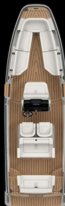
ORIGIN 71 13 Persons