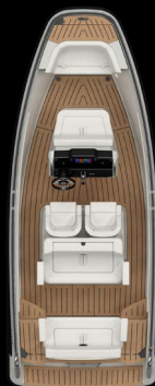
ORIGIN 57 9 Persons